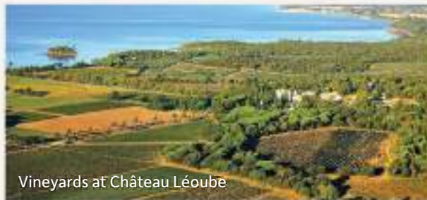
Vineyards at Château Léoube