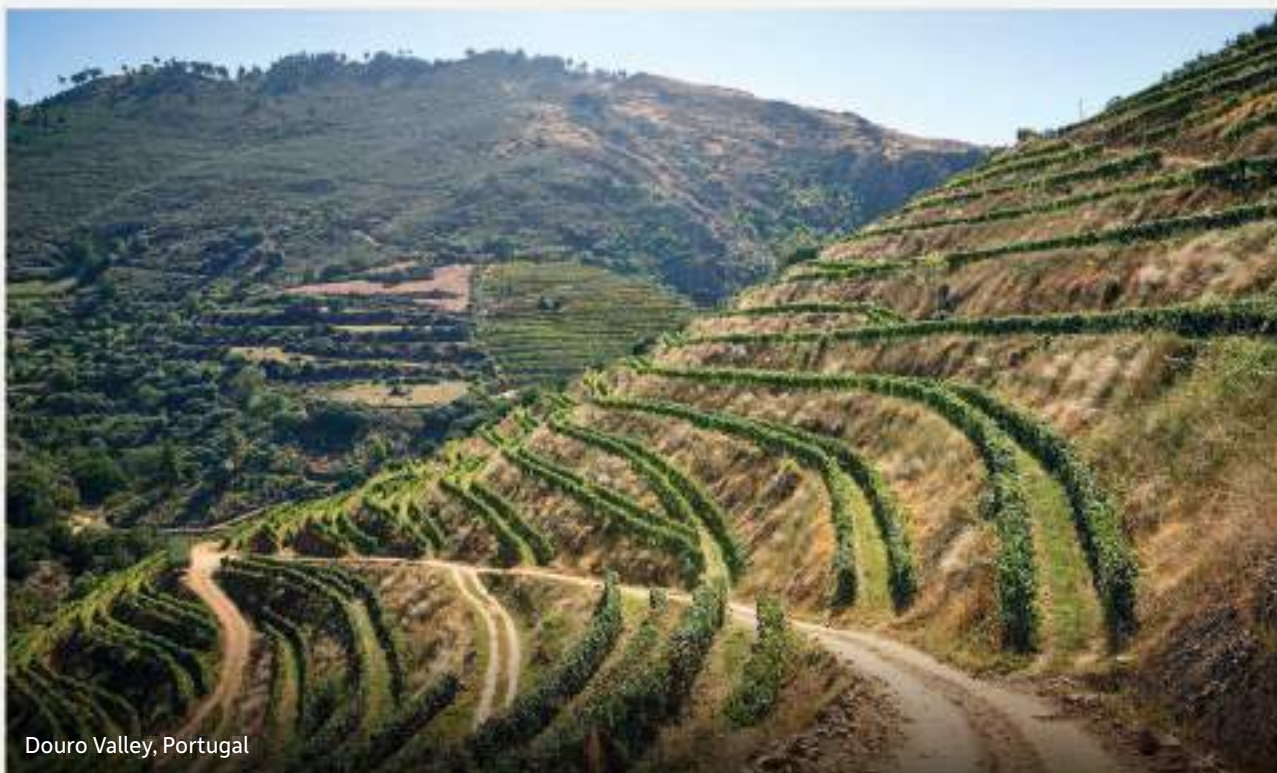
Douro Valley, Portugal