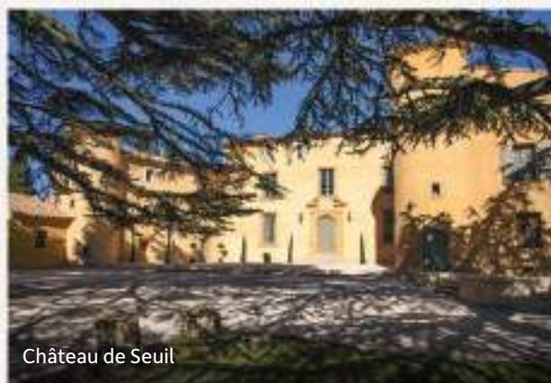
Château de Seuil

Another very good vintage from the team at Léoube, one of the few premium brands of Provence rosé where the quality of the wine matches the marketing. Predominantly Grenache and Cinsault with a little Syrah and Mourvèdre. Crystalline red berry and citrus flavours. Very long and refreshing. 14%. Now-2026. Magnums also available.