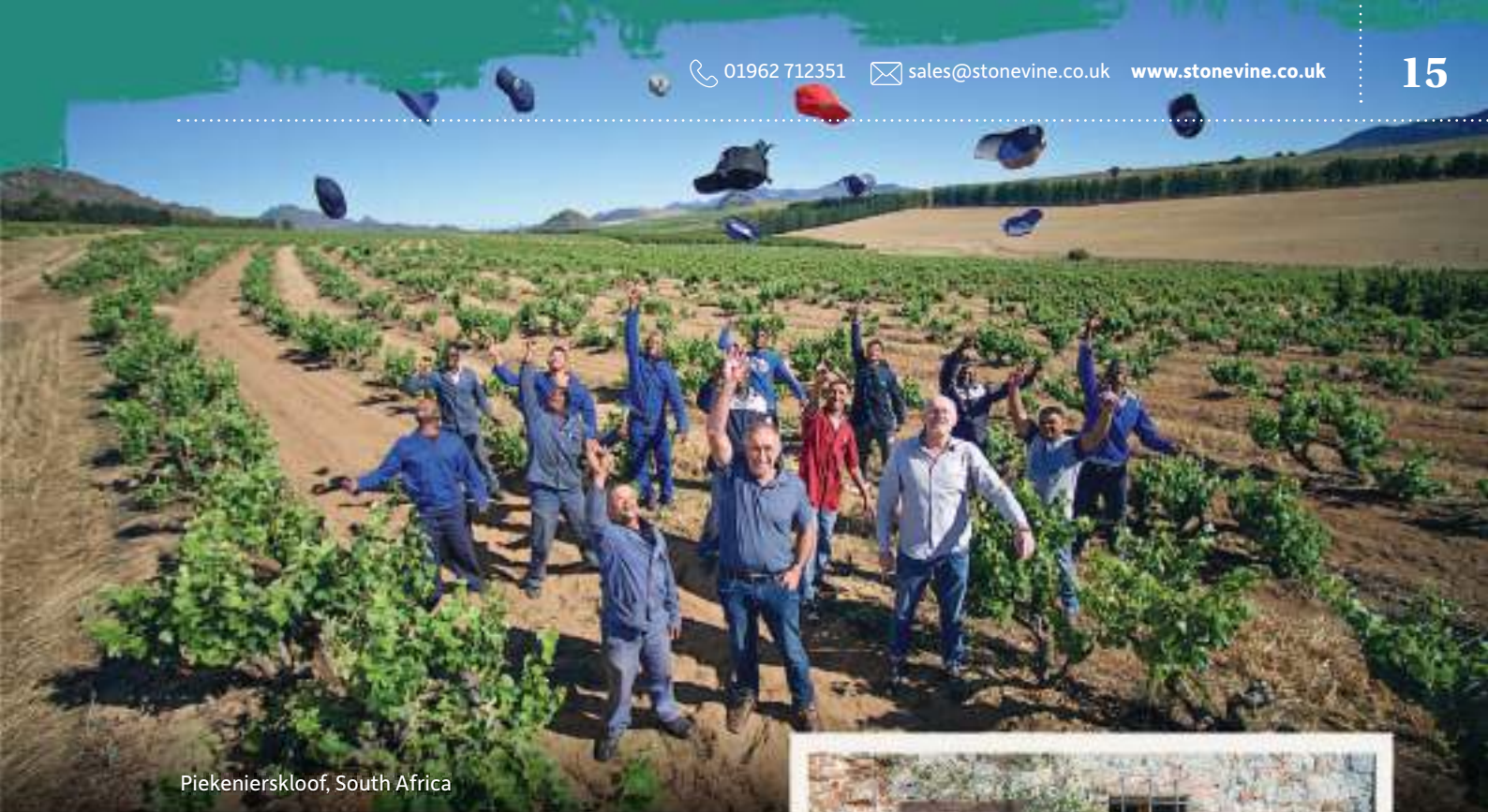
Piekenierskloof, South Africa